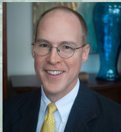
Ken Hendrickson Graduate School