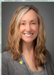
Kimberly Bell Honors College